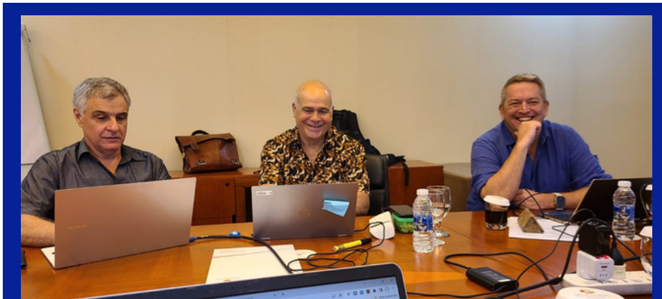
Project 24 team working collaboratively in Bahrain!

Realising the first face to face opportunity after the Review stage (Project 23) and the start of the Revision Stage (Project 24) provided an opportunity for a majority of the Steerco to sit down and deliberate the project. The focus of the discussions in Bahrain was on the Project Management requirements rather than debating the actual AM Landscape. Significant progress was made in establishing the details around the Schedule, Risk, Change Management, Communication and Team structure requirements. Since Bahrain, a number of Member organisations have set up working groups and have commenced working on identifying changes and improvement to the 2nd Edition document. The face to face meeting in early April, coinciding with the AM Council's AMPEAK Conference will realise the Milestone of being able to review the summary of the work completed internationally.